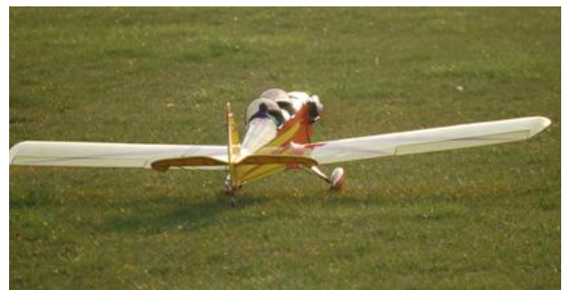
T's Spacewalker on its taxi to its maiden.