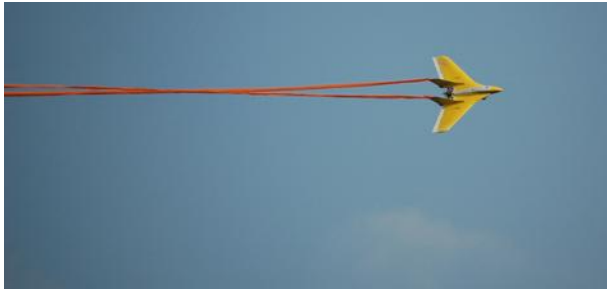
Rick Silva's streamer Striker streaks the sky.

First up was T. Most of us know that T is a master builder who seems to enjoys building as much as flying. T presented a "new" plane that he built from a kit, but which has been sitting unused in T's hangar for the last 10 years! Yes that's right, he built a Top Flight AT6 Texan with a 76 inch wing span ten years ago and, according to T, never got around to flying it (see, he may enjoy the building a little more than flying!). Anyway, it is expertly covered in Monokote including great trim, weighs 9.5 lbs. and sports a Super Tiger 90 for power. I hope we can all see this maiden soon. Nice job, as usual, on this great war bird.