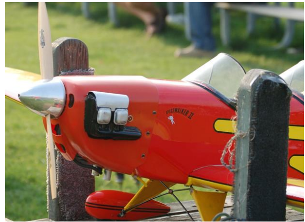
T's new Spacewalker sits ready to take flight for its maiden.

in the new 2.4 GHz world. Additionally, users of 72 MHz are encouraged to display their channel number flag on their transmitter to help other users determine their channel.