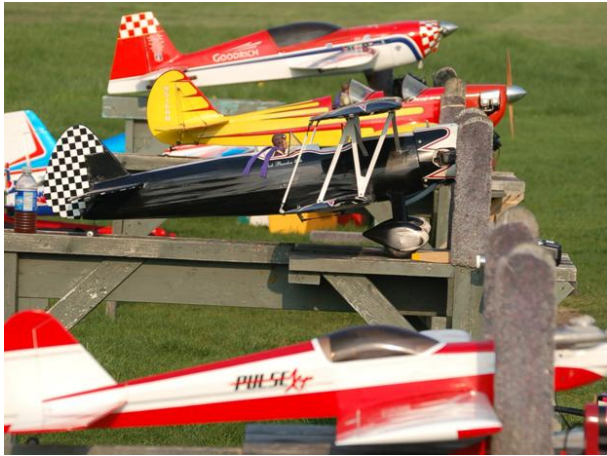
A full set of benches at the field in time for some after work flying.

to email to them in an effort to reach out to them and encourage their involvement in the club.