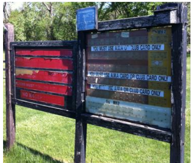
Yes, I think it was time to replace the frequency board.