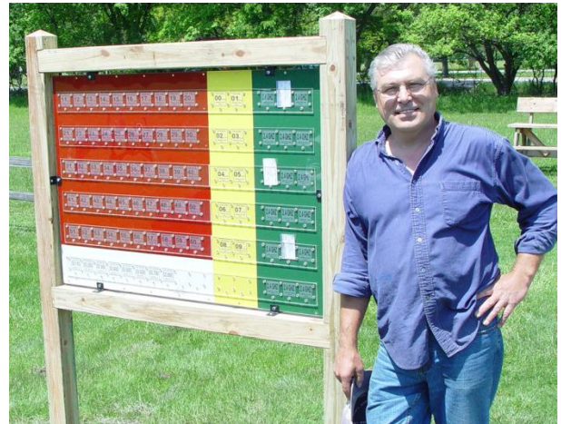
T poses proudly with the new frequency board. A job well done!