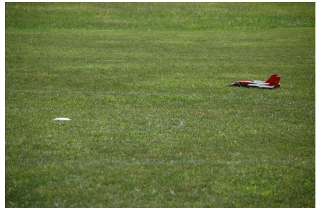
That is what I call close to the spot!