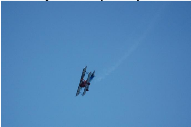
Don Zeller's WWI biplane makes a dramatic dive.