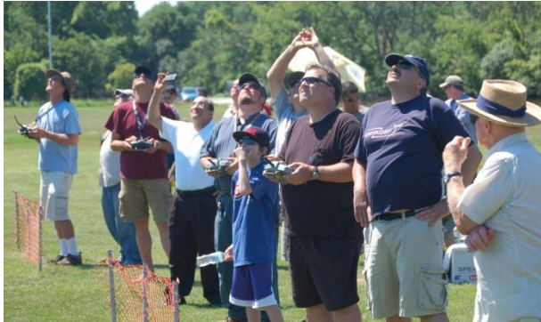
The hang and glide contest had everyone looking to the heavens.