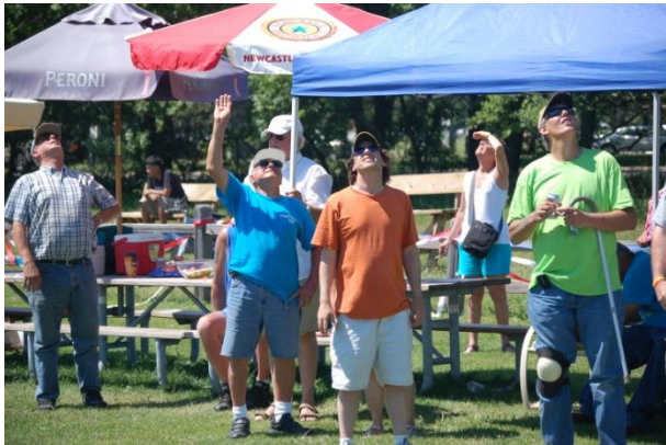
Boy they went up there high!