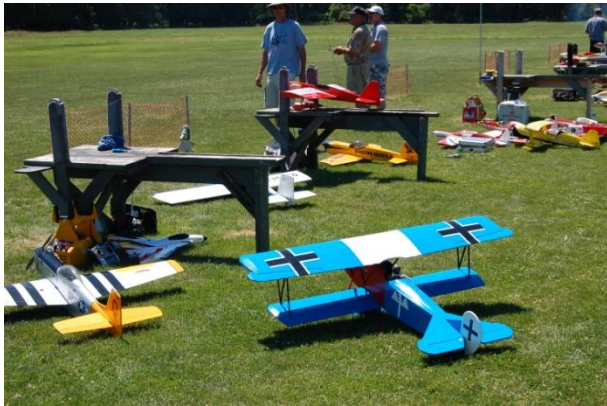
Plenty of planes were on hand. Note Don's biplane safely on the ground after an "interesting" landing.