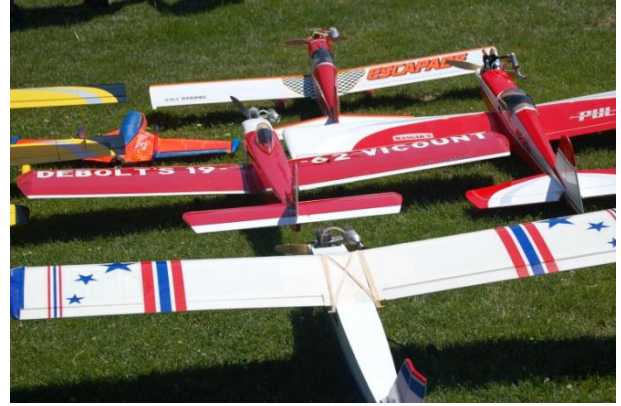
We sure had a variety of planes to fly.