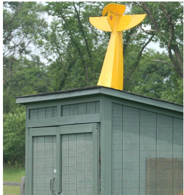
Someone had a bad day with their Cub!

markings were working out great. Mike noted that the club has spent about $120 annually on striping paint, and that the use of weed killer was saving that and the need to maintain after cutting. The